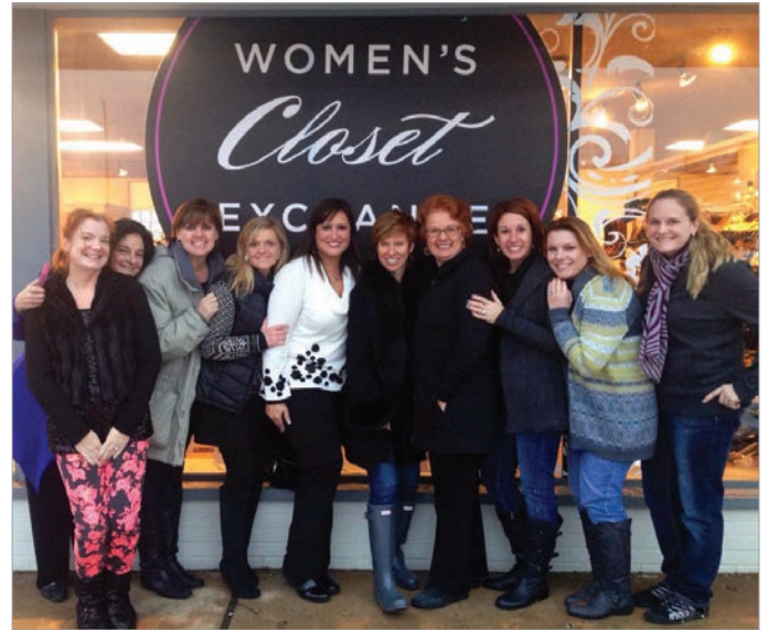
JLE members travelled to the Women’s Closet Exchange this past December to get in some last-minute holiday shopping. The League is partnering with the nationally known resale store on an upcoming fundraiser.